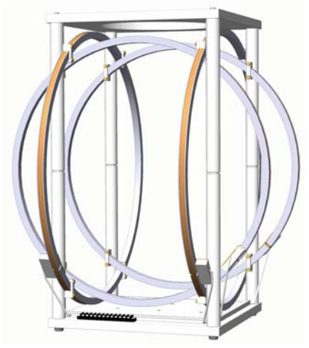
Fig. 2: BH600-2A-B / 2 axes: X, Y