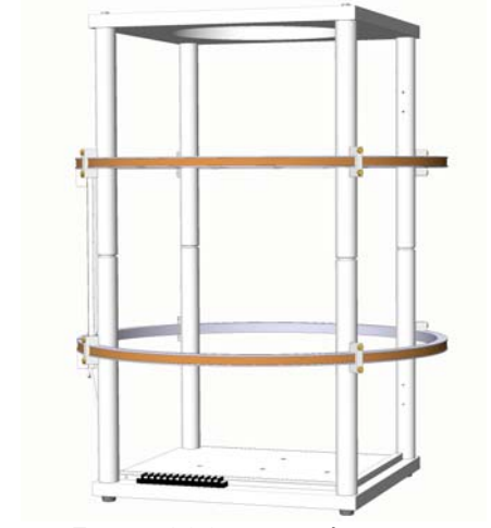
Fig. 5: BH600-1B-B / 1 axis: Z

- The coil specifications are in our Internet site: www.serviciencia.es -