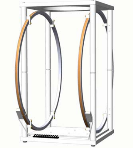
Fig. 4: BH600-1A-B / 1 axis: X