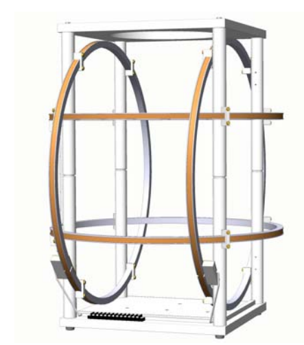
Fig. 3: BH600-2B-B / 2 axes: X, Z